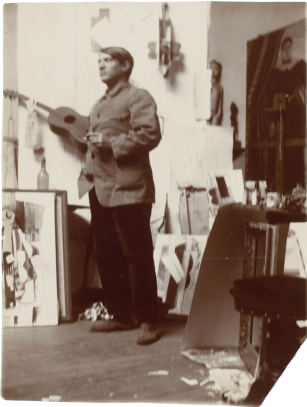
Portrait of Pablo Picasso, 1913